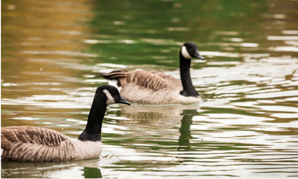
Canadian geese are visting Las Colinas en route to their warmer destination.