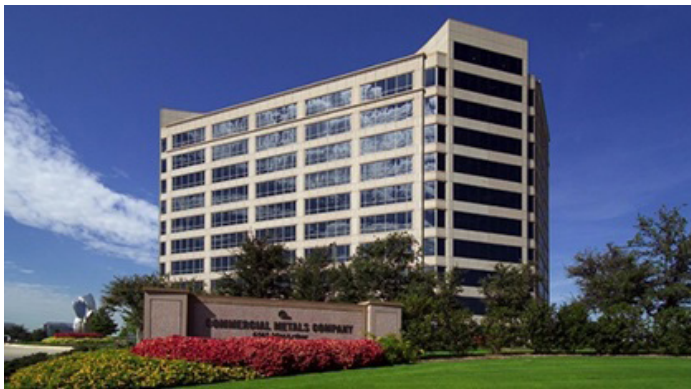
The corporate headquarters of Commercial Metals Company located on North MacArthur Blvd.

As of October 2016, at the top, ExxonMobil ranks number 2 with a $246 billion in revenues. Kimberly-Clark ranks 151 with $18 billion in revenues, following closely, Fluor ranks 155 with $18 billion in revenues. Commercial Metals came in at 417 with $6 billion in revenues and not too far behind, Celanese placed at 453 with $5 billion in revenues.