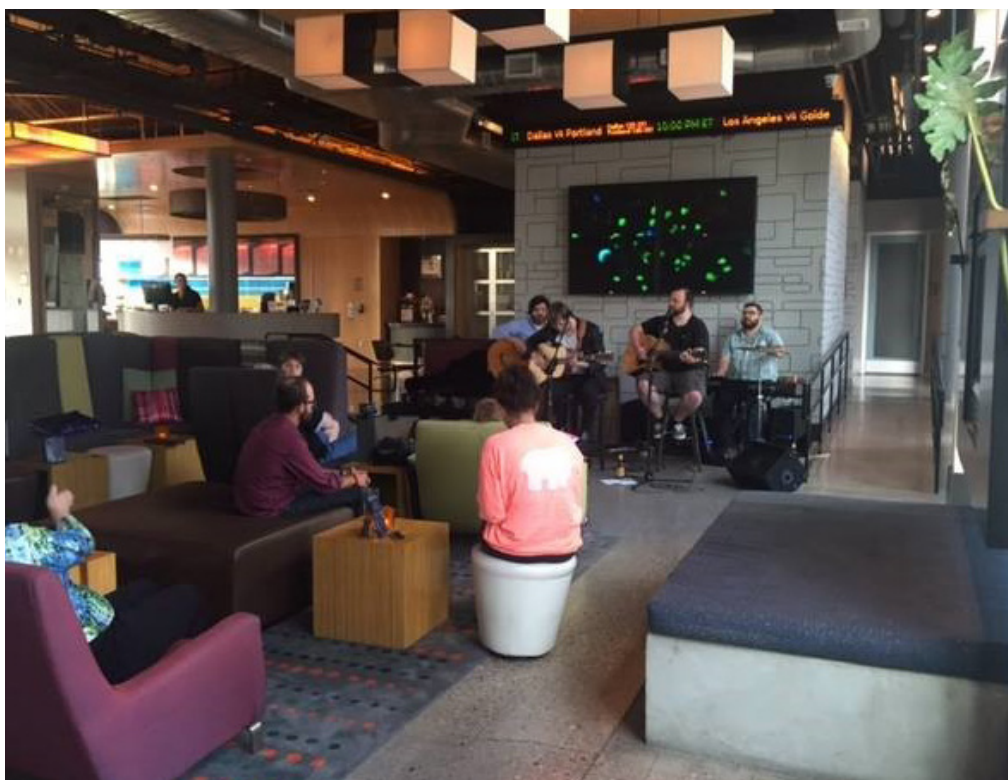
Live music at the WXYZ Bar in Aloft Hotel.